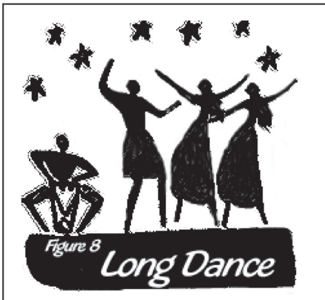
Figure 8 East-West Bridge LONG DANCE

Sponsored by: Akhand Param Dham of America & The Earth Center